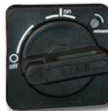
Rugged disconnect includes padlock provisions.