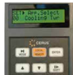
The 32-character backlit LCD screen displays the drive's operational status and parameter settings. A very easy drive to set up.