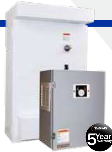
Representative photo only (actual product may vary based on configuration selections)